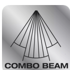
Combo Beam Combined beam of light