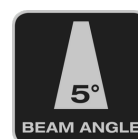
Beam angle 5° Exceptionally focused beam angle